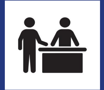
Customer Service Practitioners