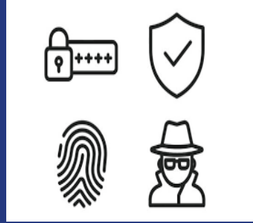
Cyber Security Analysts