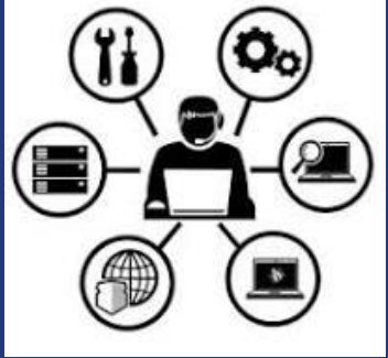
Digital Support Technicians