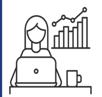
Data Analysts & Business Analysts